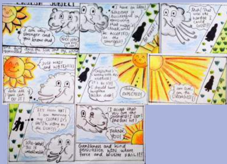
Comic By Vaishnavi 8b