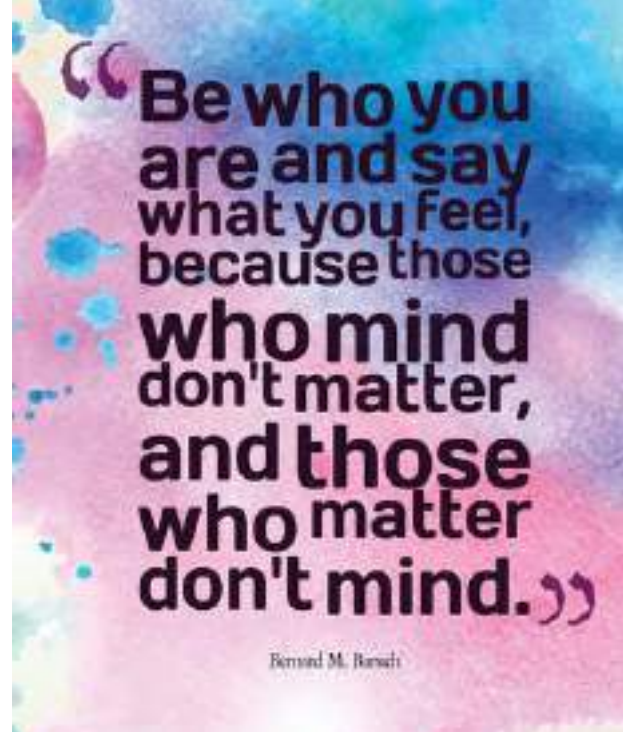
Painting By: Jasna, 7A

My eyes are clouded just like the sky, My tears are falling just like rain, The thunder can be heard for miles, But like always stifled are my cries Because It is I ... that must always pay the price What is happening to this world? My Trees ruthlessly slaughtered for timber, Baby animals crying for their mothers dead. A sunless sky choking with smog, The dying sighs of the lake and bog, The green struggling amongst the grey. Should our planet be this way? What is happening to the world? No animal is free, Not a leaf on a tree. Garbage here, Plastic there. Hot in the summer, Hot in the winter, The earth is boiling with anger! The greed of your species knows no bounds, Sundering the bonds delicately woven With nature, with the soul, with the animals, With Me, Mother Earth myself! It has taken a virus to lock you in And set free the nature, Is this not enough to make you Fear for your future? How much do you really need, And how endless is your greed?! Wake up people! Wake up! Wake up and look- Mend the bonds, Help our angry dying Earth, Let me revive its colours, Let me show its happiness, Let me live its days everlasting. Stand up for the planet! And, once again- The birds line up on your balcony, Animals roam free, The trees dance in the wind, The weather pleasant as can be- This is the Earth that should be, This is the commitment that must be And if you abide , it shall be the earth we all wish for it to be.